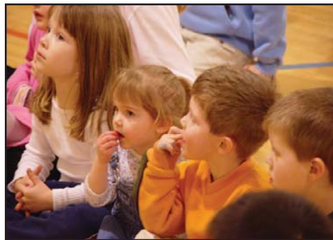
SWIF provides opportunities to equip all southwest Minnesota adults with knowledge and tools to help our youngest citizens learn, love and thrive.