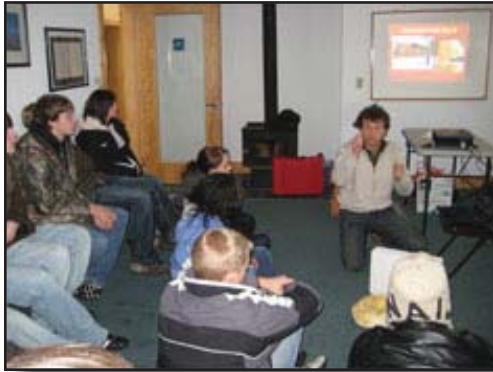
Westbrook-Walnut Grove and Windom YES! Teams were among those in attendance at the YES! Winter Workshop at Shalom Hill Farm.